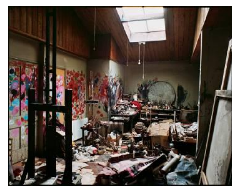
7 Reece Mews Francis Bacon Studio.

A Resource for Leaving Certificate Art Craft and Design Students Considering the Gallery Question