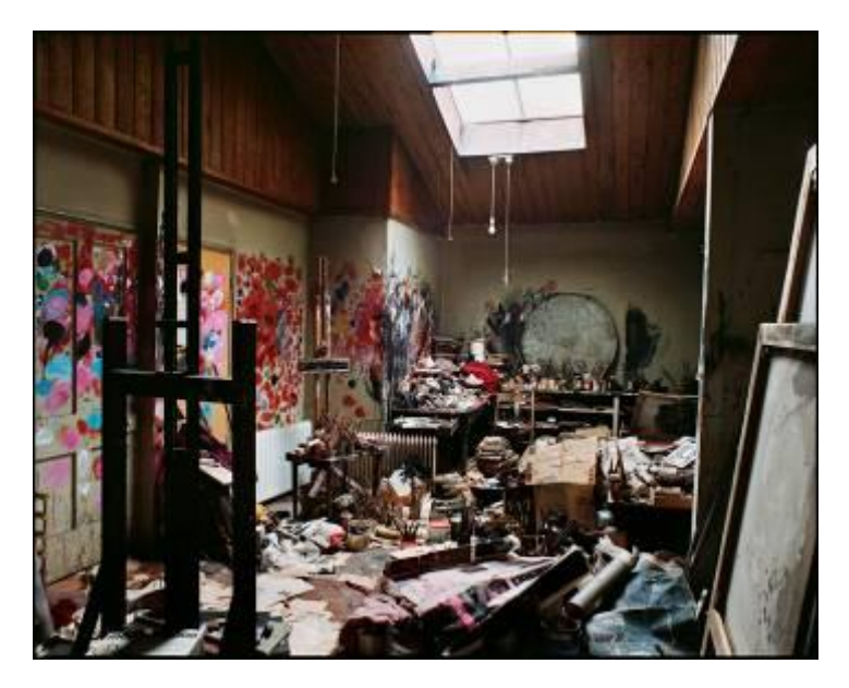
7 Reece Mews Francis Bacon Studio.

Can you find the wooden stairs that is inset into the ground of the studio complex? It is the original stairs from 7 Reece Mews. How does if feel hovering over the stairs? Can you imagine Bacon ascending the stairs, to enter the studio and his living quarters that were located on the first floor of the mews? What do you think is the significance of visualising this journey?